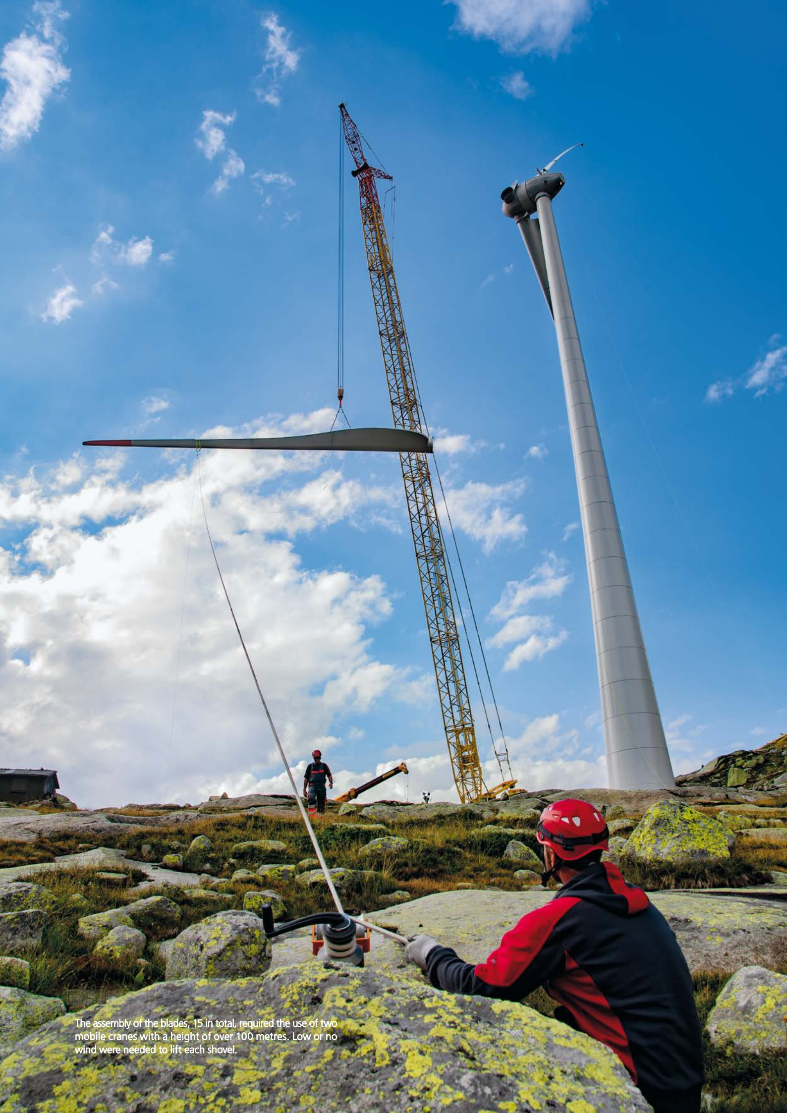
The assembly of the blades, 15 in total, required the use of two mobile cranes with a height of over 100 metres. Low or no wind were needed to lift each shovel.