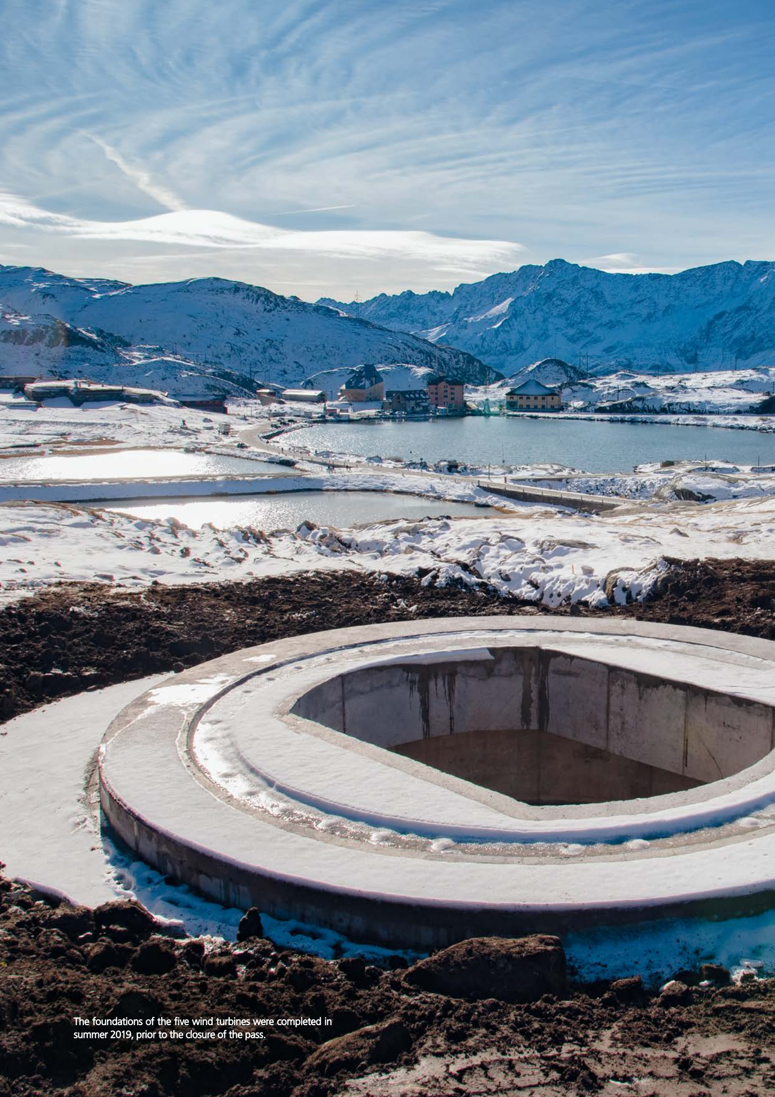
The foundations of the five wind turbines were completed in summer 2019, prior to the closure of the pass.