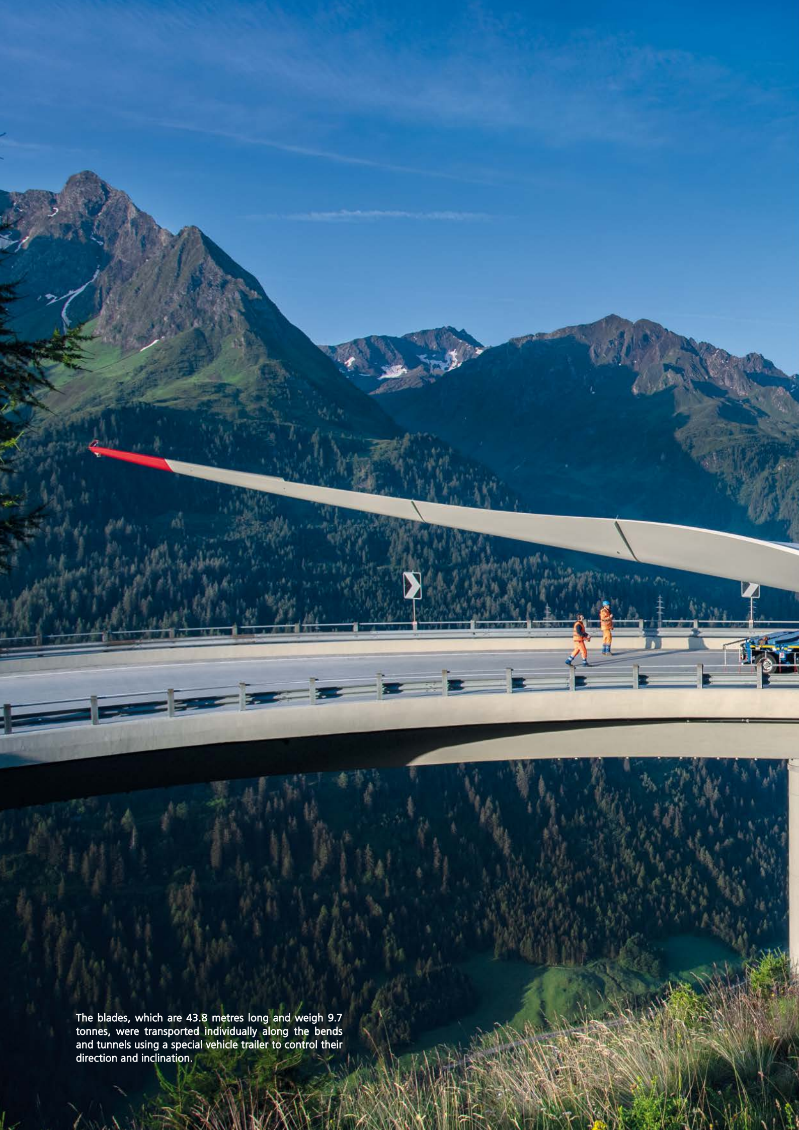
The blades, which are 43.8 metres long and weigh 9.7 tonnes, were transported individually along the bends and tunnels using a special vehicle trailer to control their direction and inclination.