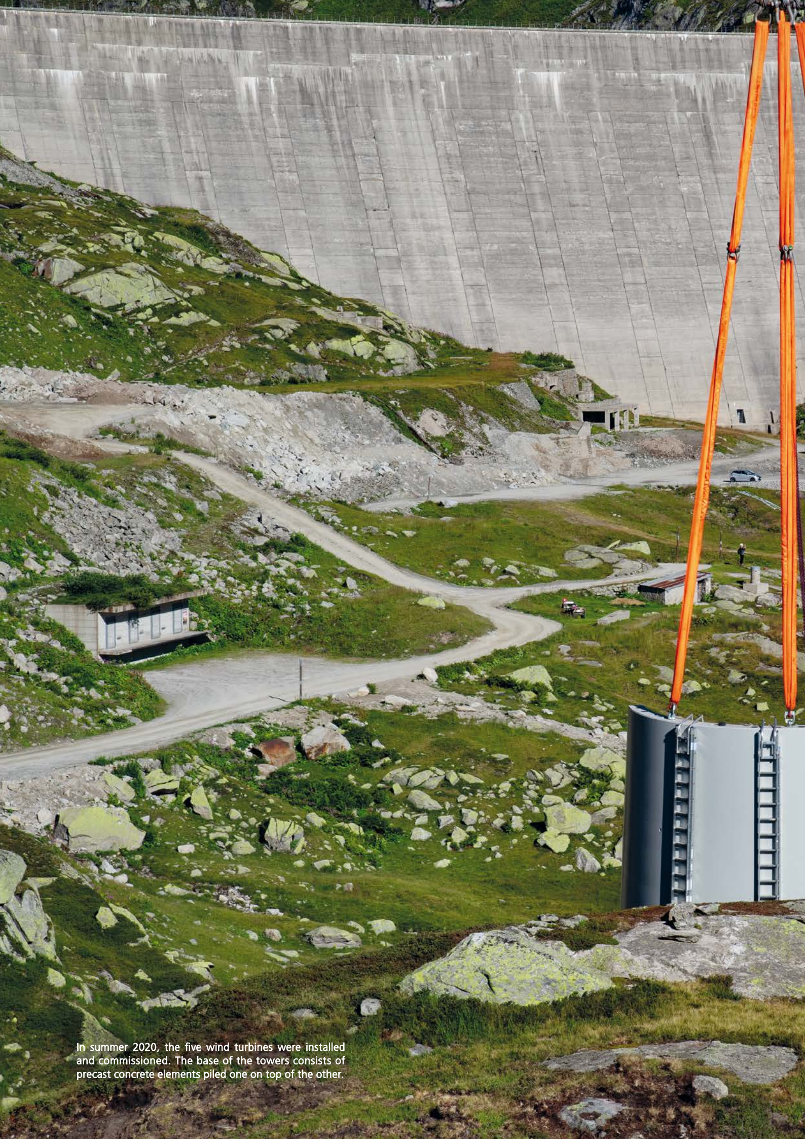
In summer 2020, the five wind turbines were installed and commissioned. The base of the towers consists of precast concrete elements piled one on top of the other.