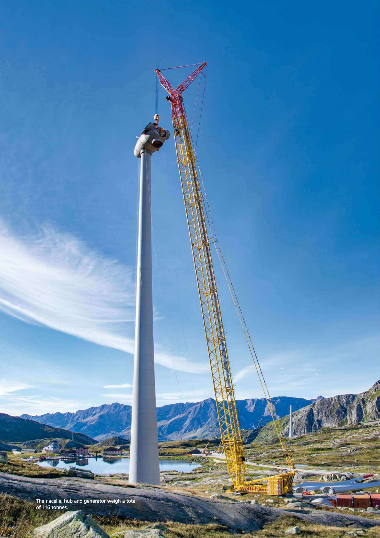
The nacelle, hub and generator weigh a total of 116 tonnes.