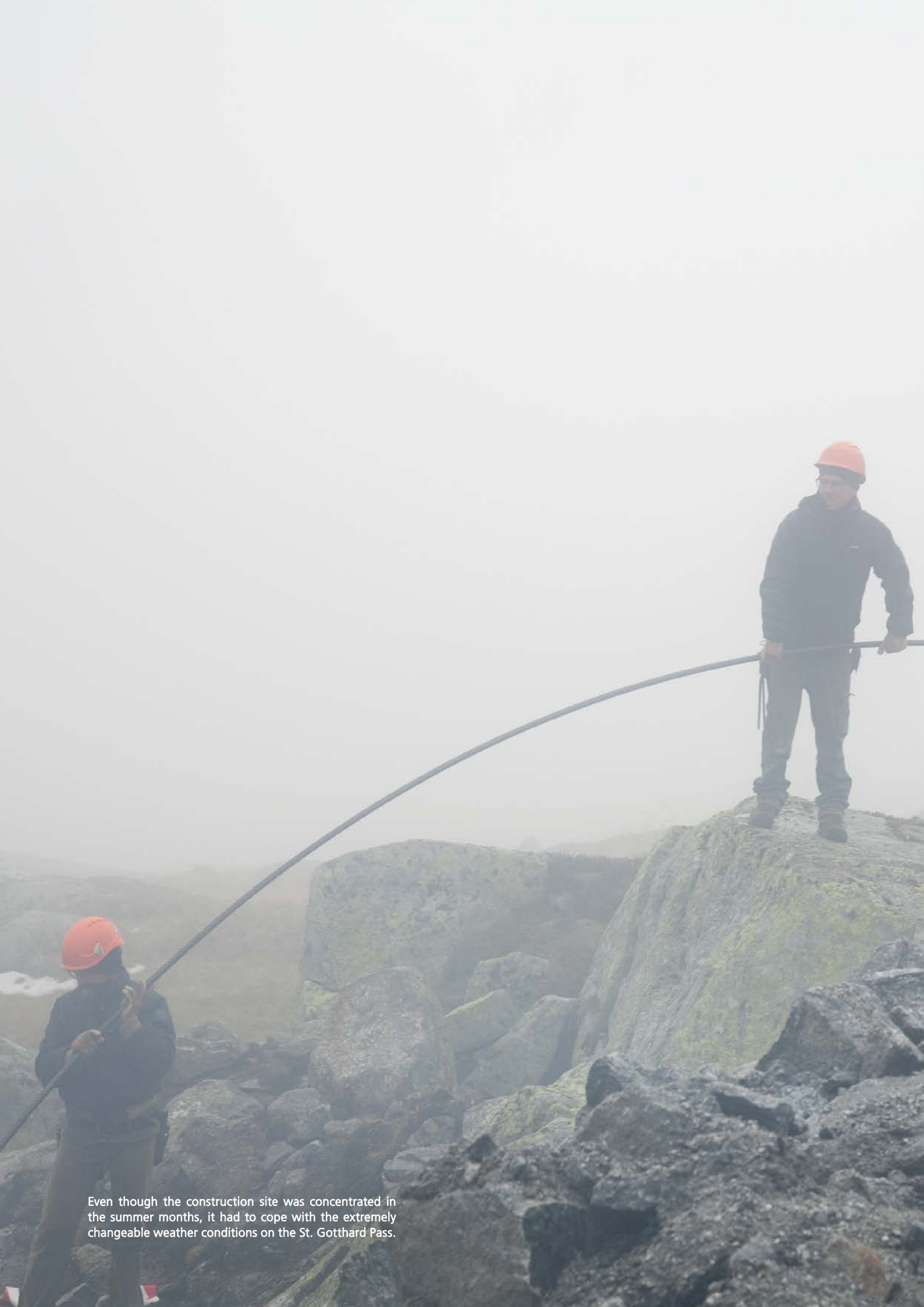
Even though the construction site was concentrated in the summer months, it had to cope with the extremely changeable weather conditions on the St. Gotthard Pass.