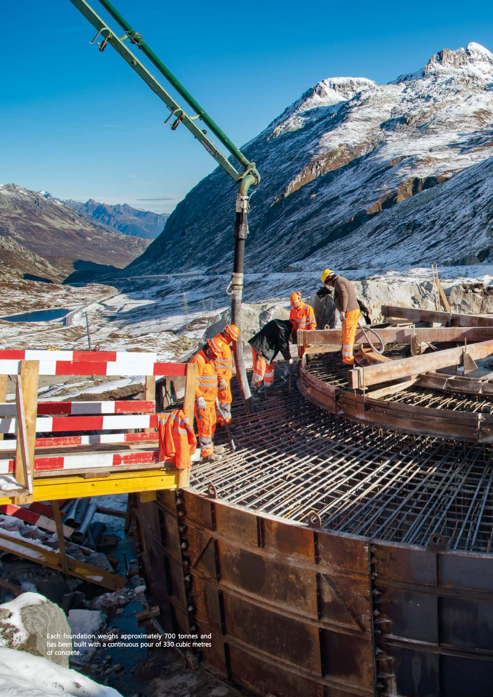
Each foundation weighs approximately 700 tonnes and has been built with a continuous pour of 330 cubic metres of concrete.