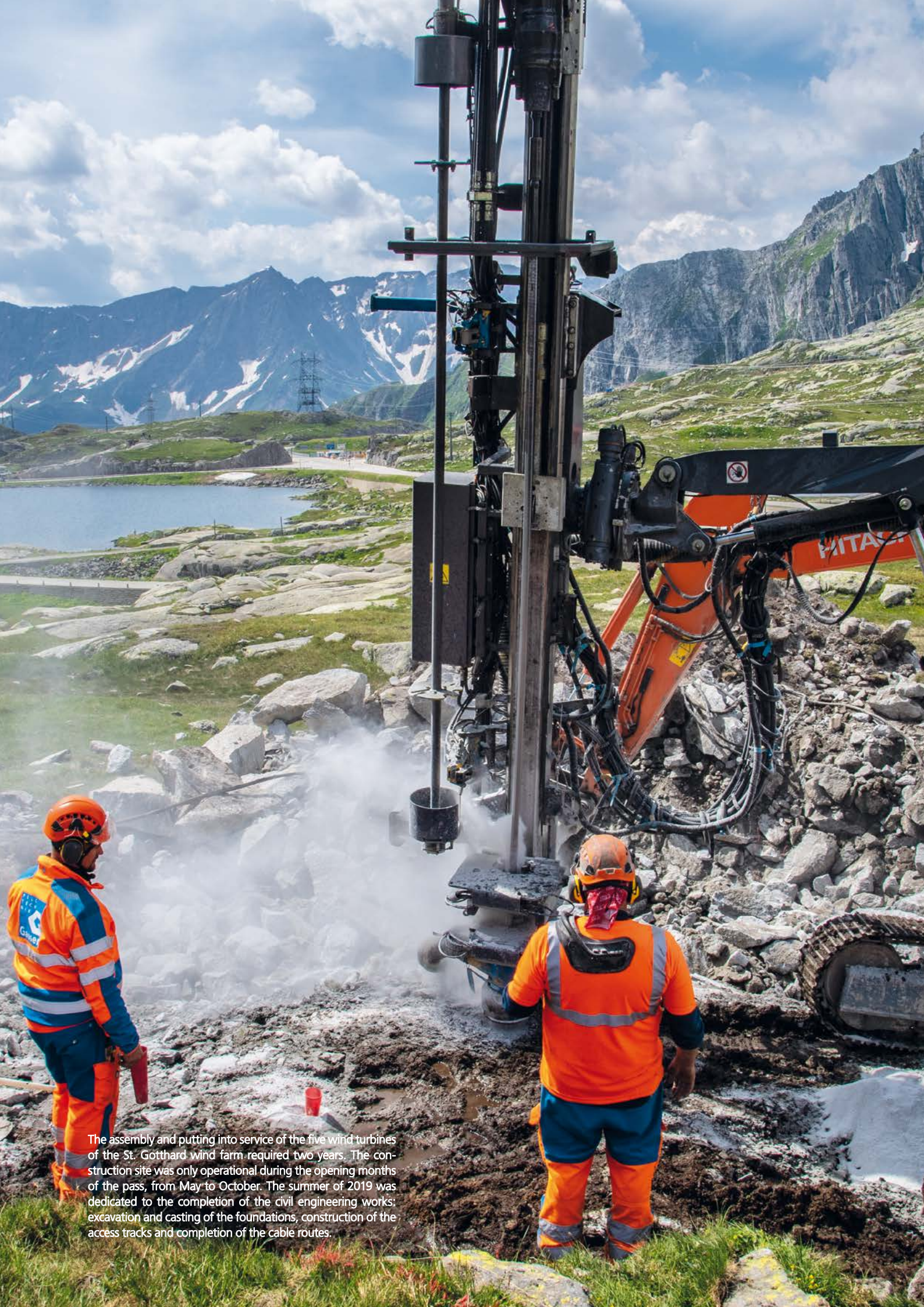
The assembly and putting into service of the five wind turbines of the St. Gotthard wind farm required two years. The construction site was only operational during the opening months of the pass, from May to October. The summer of 2019 was dedicated to the completion of the civil engineering works: excavation and casting of the foundations, construction of the access tracks and completion of the cable routes.