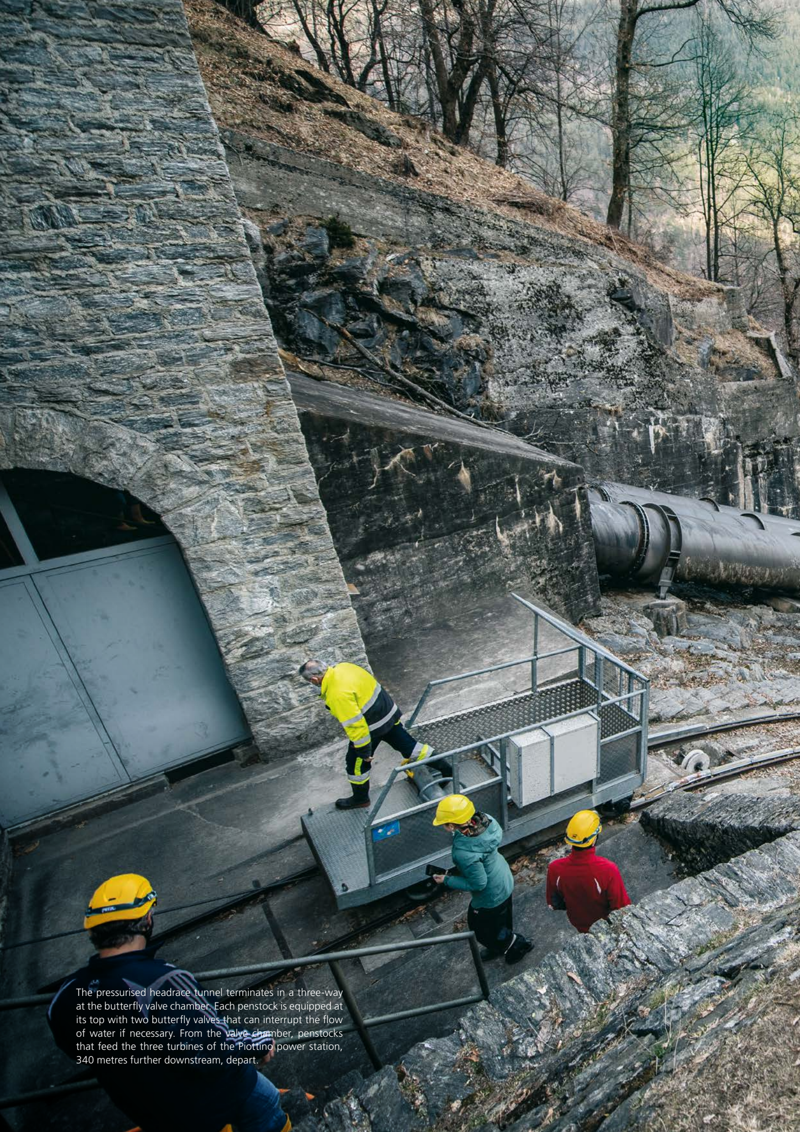
The pressurised headrace tunnel terminates in a three-way at the butterfly valve chamber. Each penstock is equipped at its top with two butterfly valves that can interrupt the flow of water if necessary. From the valve chamber, penstocks that feed the three turbines of the Piottino power station, 340 metres further downstream, depart.