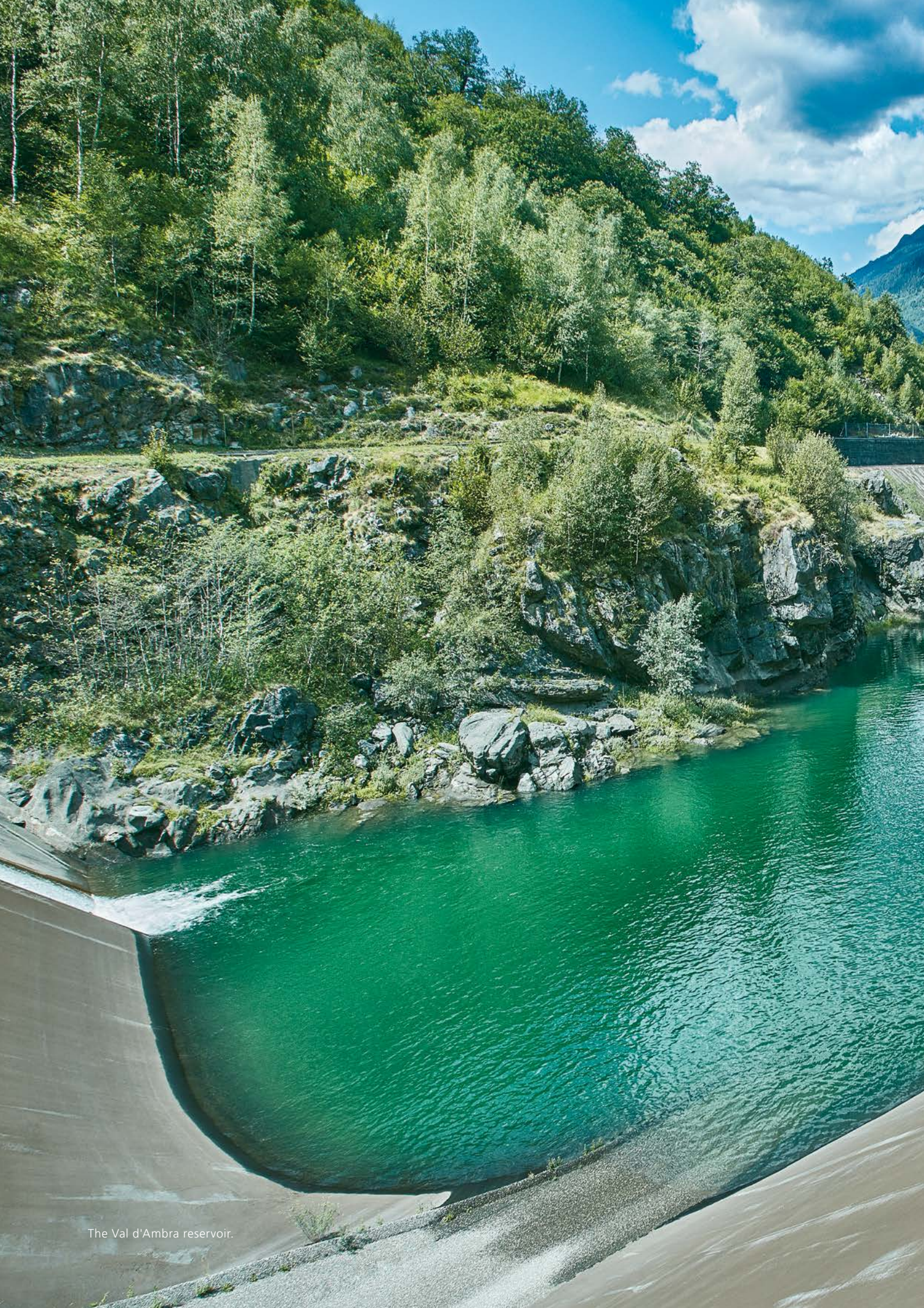
The Val d'Ambra reservoir.