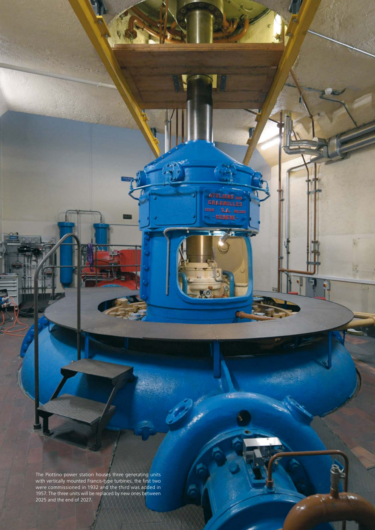
The Piottino power station houses three generating units with vertically mounted Francis-type turbines, the first two were commissioned in 1932 and the third was added in 1957. The three units will be replaced by new ones between 2025 and the end of 2027.