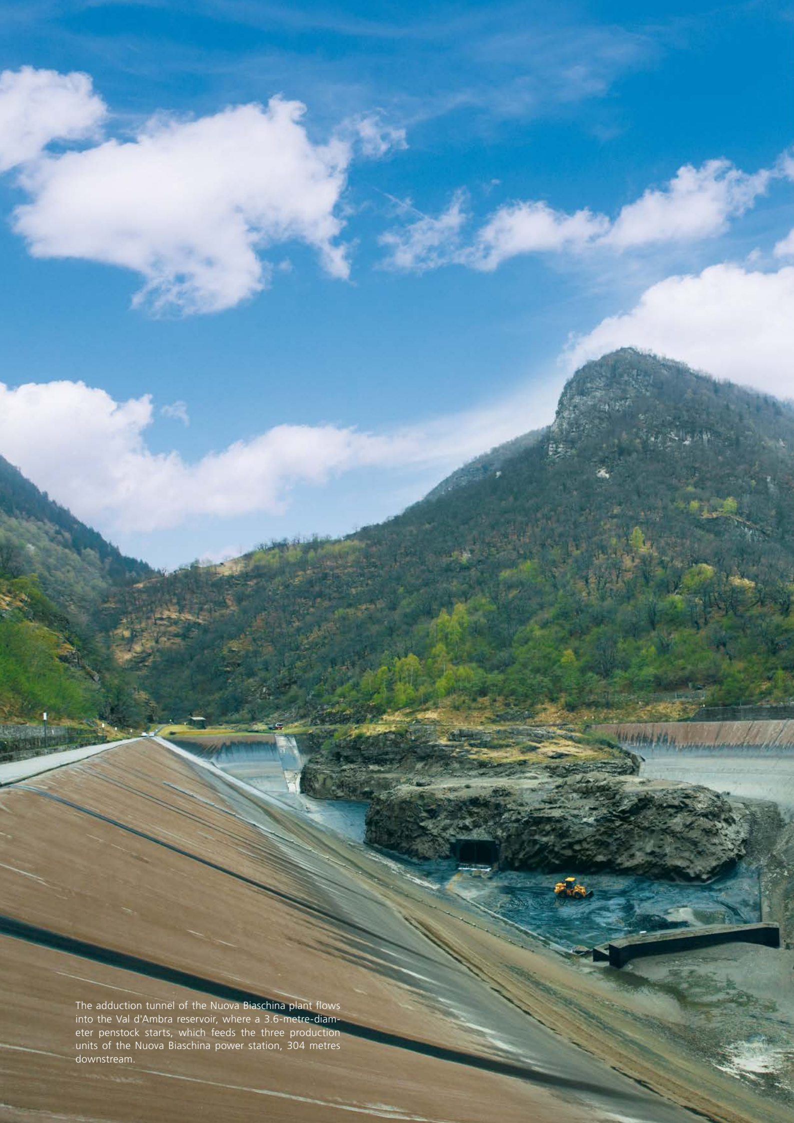
The adduction tunnel of the Nuova Biaschina plant flows into the Val d'Ambra reservoir, where a 3.6-metre-diameter penstock starts, which feeds the three production units of the Nuova Biaschina power station, 304 metres downstream.