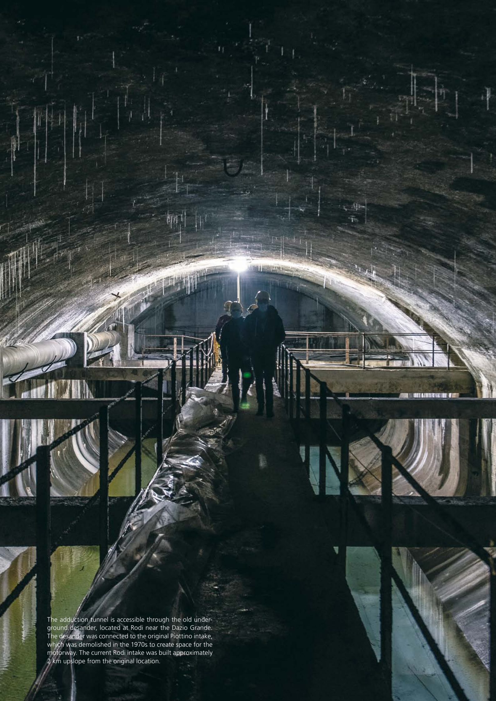
The adduction tunnel is accessible through the old underground desander, located at Rodi near the Dazio Grande. The desander was connected to the original Piottino intake, which was demolished in the 1970s to create space for the motorway. The current Rodi intake was built approximately 2 km upslope from the original location.