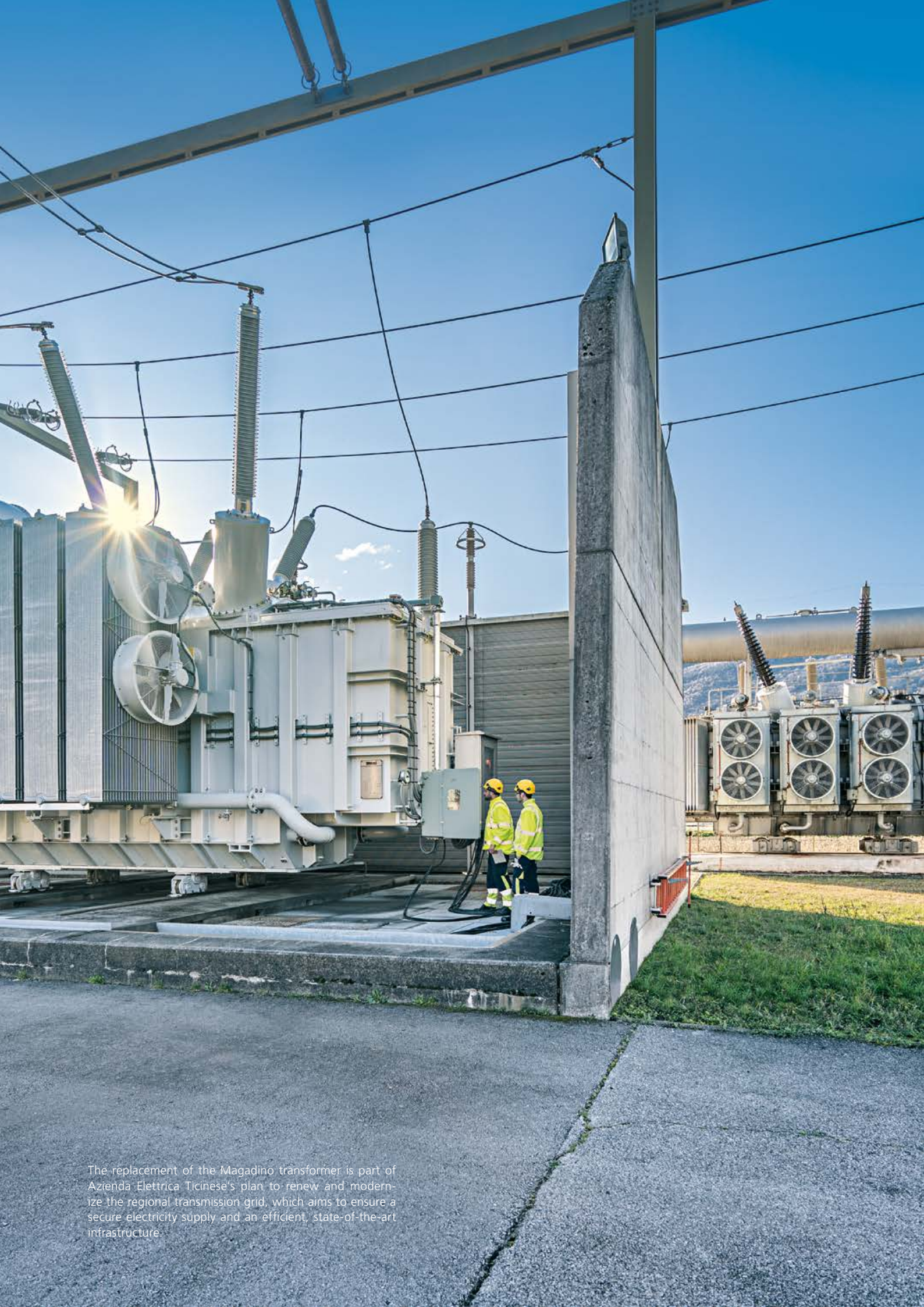
The replacement of the Magadino transformer is part of Azienda Elettrica Ticinese's plan to renew and modernize the regional transmission grid, which aims to ensure a secure electricity supply and an efficient, state-of-the-art infrastructure.