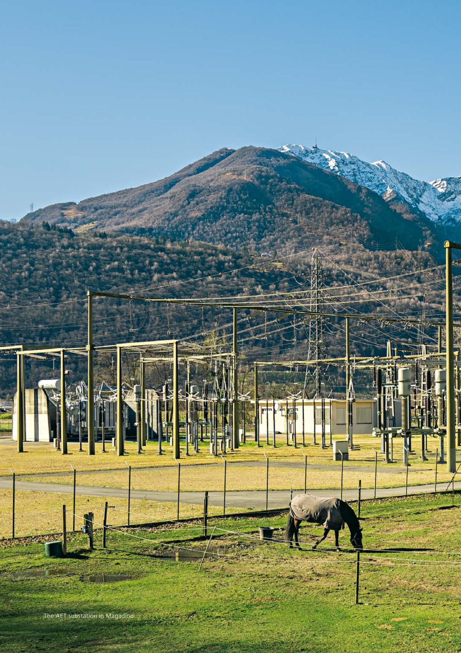
The AET substation in Magadino.