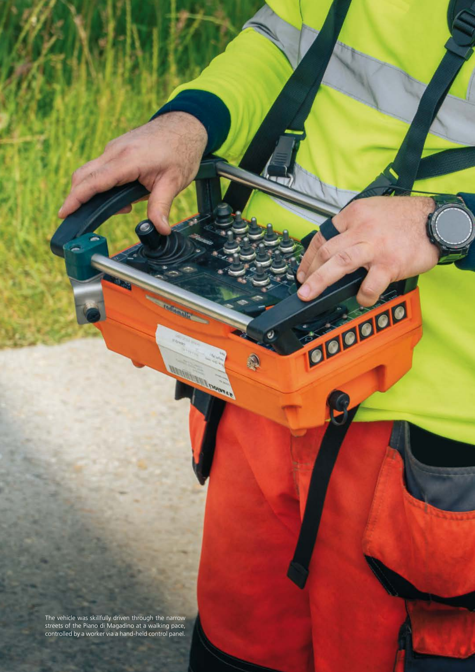
The vehicle was skillfully driven through the narrow streets of the Piano di Magadino at a walking pace, controlled by a worker via a hand-held control panel.