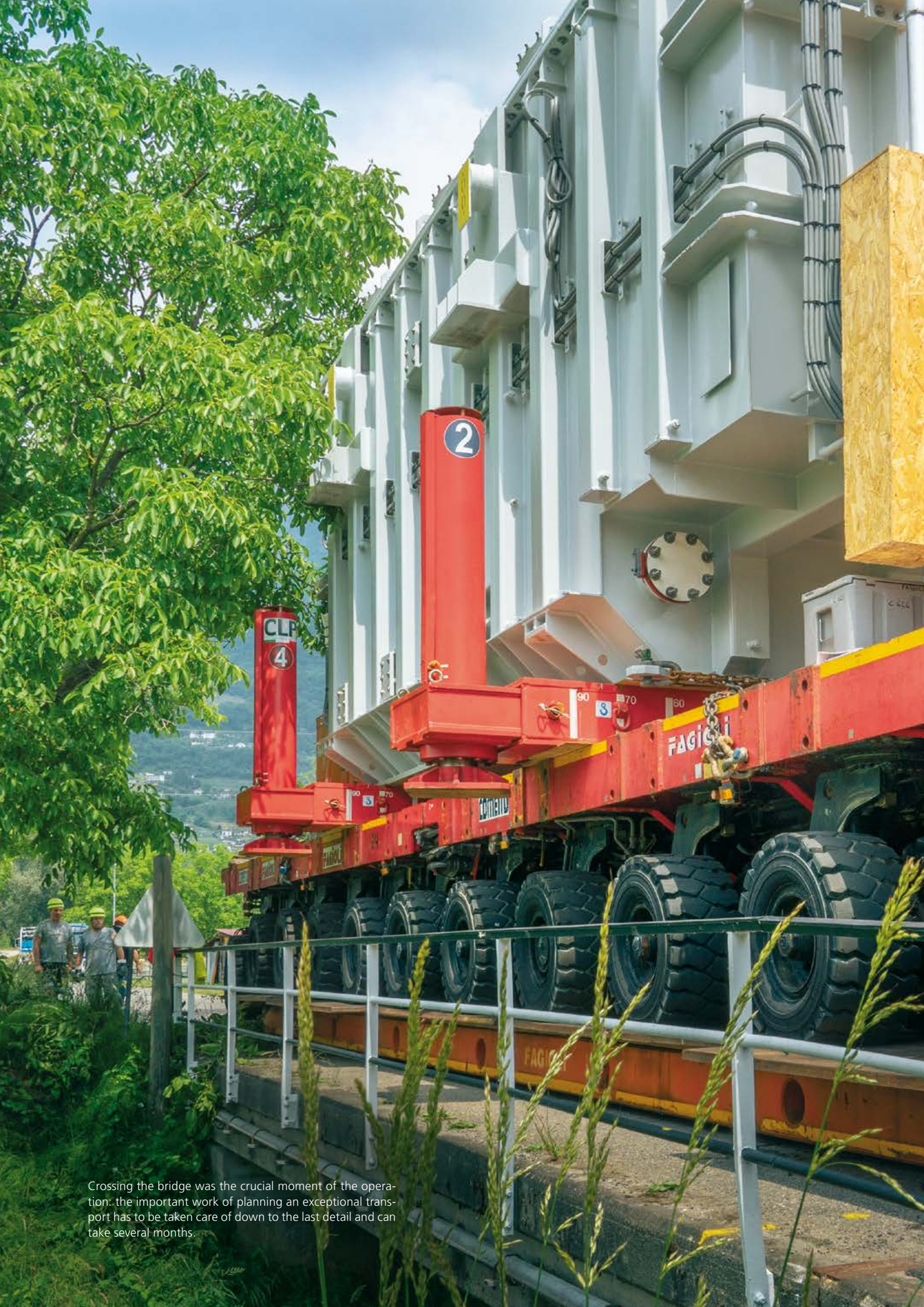
Crossing the bridge was the crucial moment of the operation: the important work of planning an exceptional transport has to be taken care of down to the last detail and can take several months.