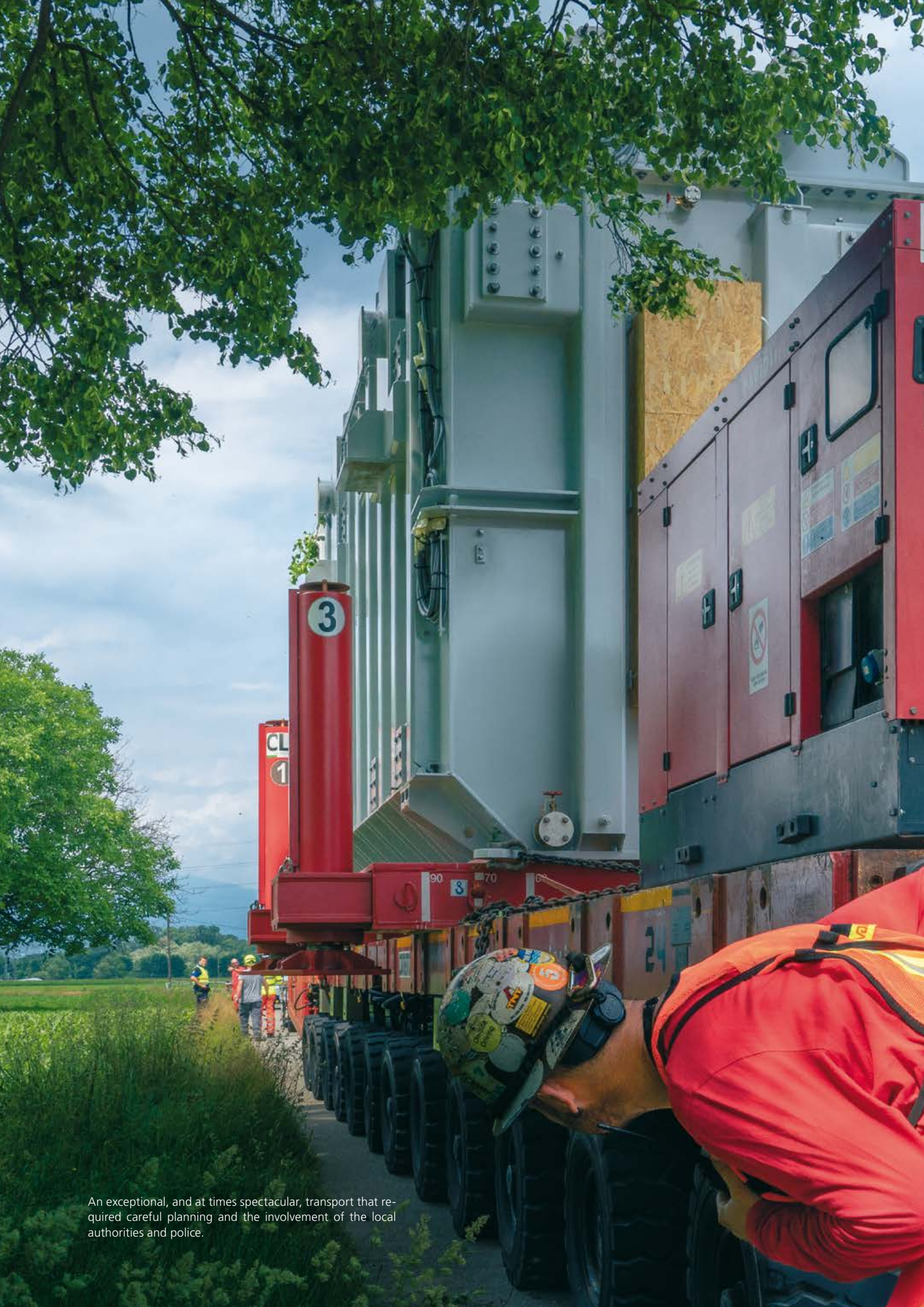
An exceptional, and at times spectacular, transport that required careful planning and the involvement of the local authorities and police.